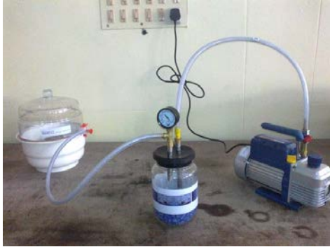
Fig. 2 Set up for vacuum curing

Vacuum was maintained for three hours. Petroleum jelly was used to minimize the leakage of air. After three hours, the valve of the vacuum desiccator was turned and cooled de-aerated water was allowed to enter the desiccator, which is called vacuum soaking. De-aerated water was prepared by boiling water in a beaker and allowing it to cool in a closed vessel. Once the specimens are immersed in water, the valve was turned to previous position. The pump was kept running during this stage, and vacuum was maintained for one more hour. After one hour, the valve was removed from the vacuum desiccator and air was allowed to enter the desiccator. The specimens were left in water for 18 hours.