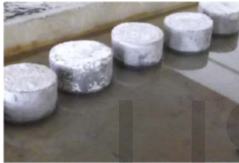
Fig. 1 Test Setup for Sorptivity

A graph was plotted for I versus square root of time in seconds. The slope of best fit curve was taken as the sorptivity in \text{mm}/\text{s}^{1/2} .